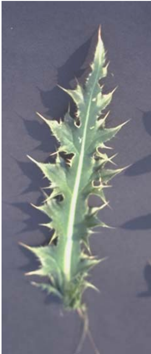
musk thistle leaf