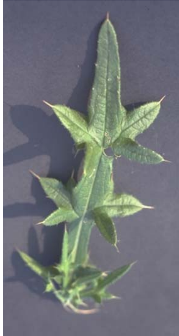
bull thistle leaf