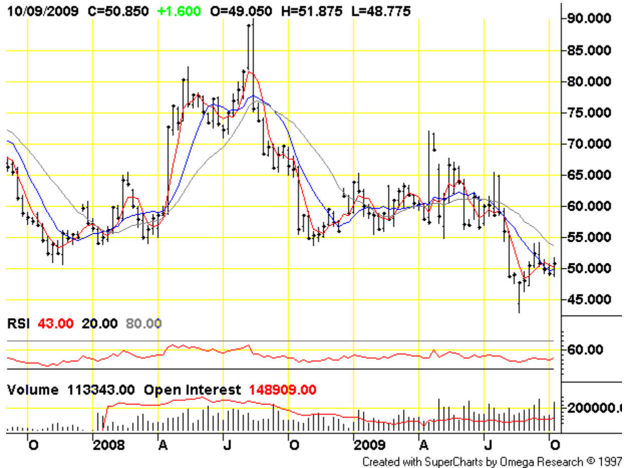
Chart courtesy of TradingCharts.com: http://futures.tradingcharts.com/