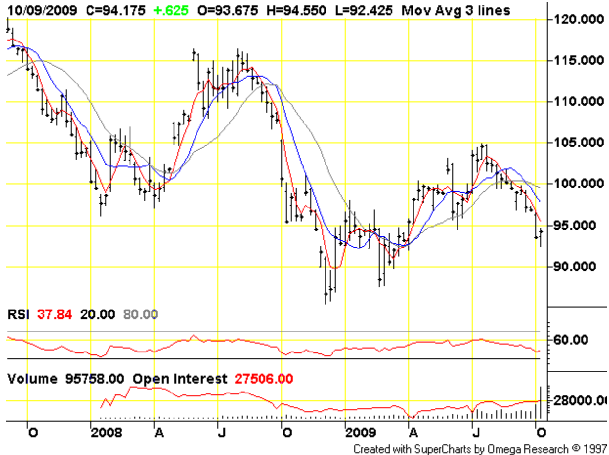
Chart courtesy of TradingCharts.com: http://futures.tradingcharts.com/