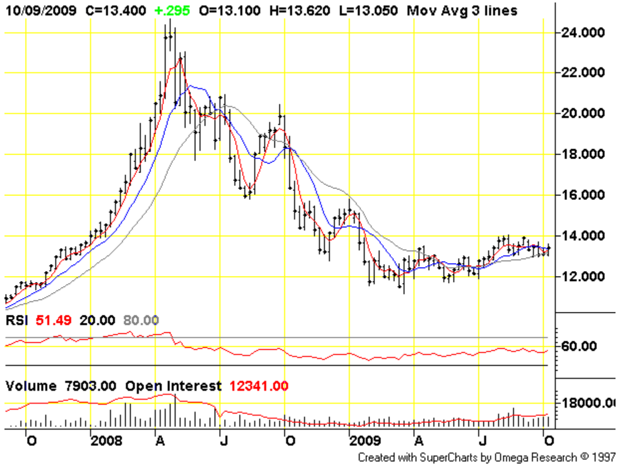
Chart courtesy of TradingCharts.com: http://futures.tradingcharts.com/