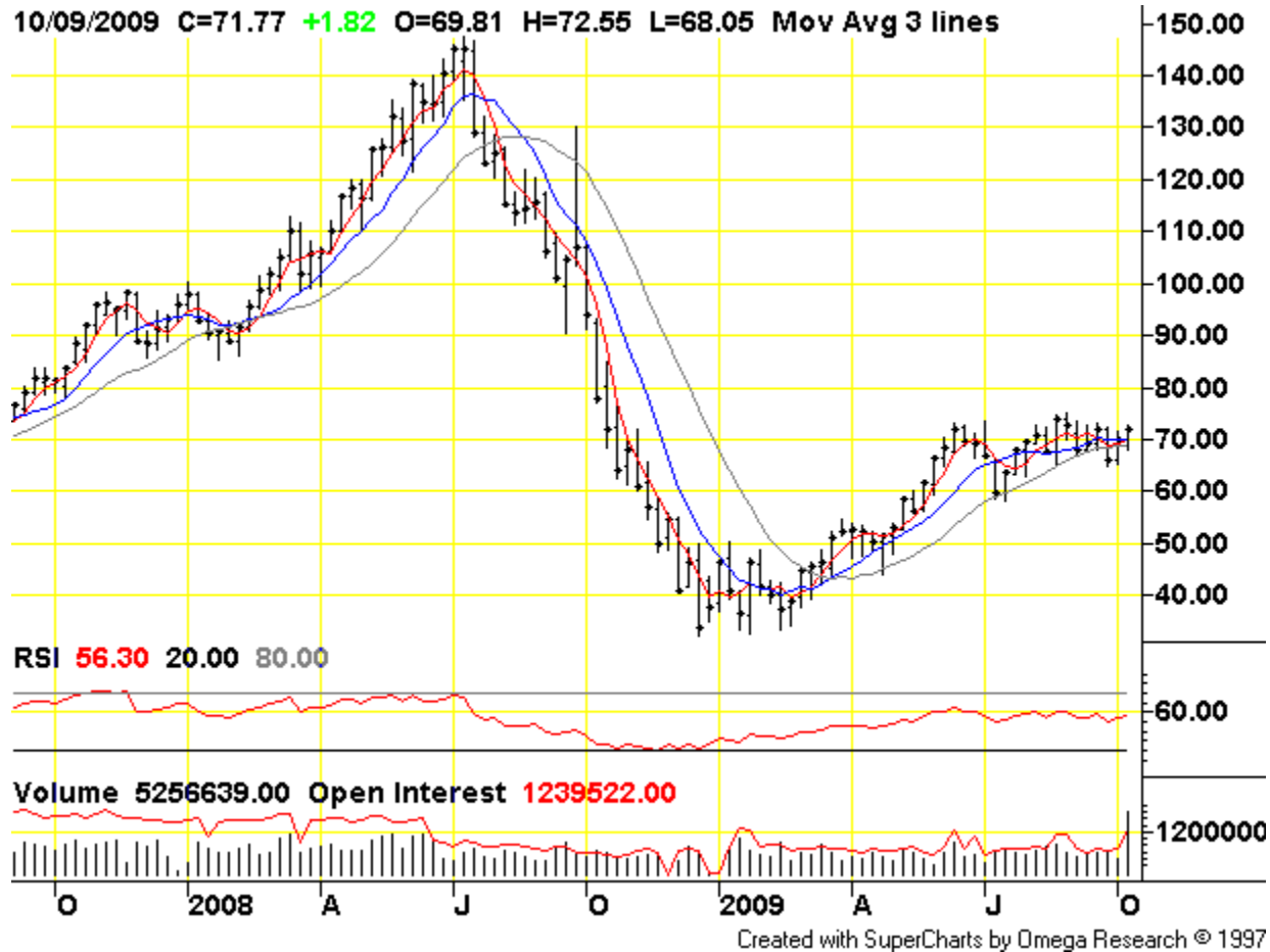
Chart courtesy of TradingCharts.com: http://futures.tradingcharts.com/