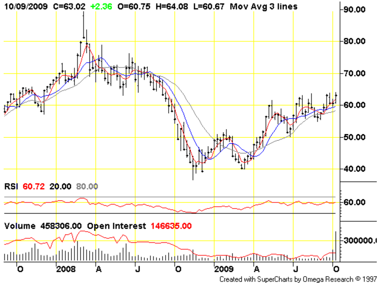
Chart courtesy of TradingCharts.com: http://futures.tradingcharts.com/