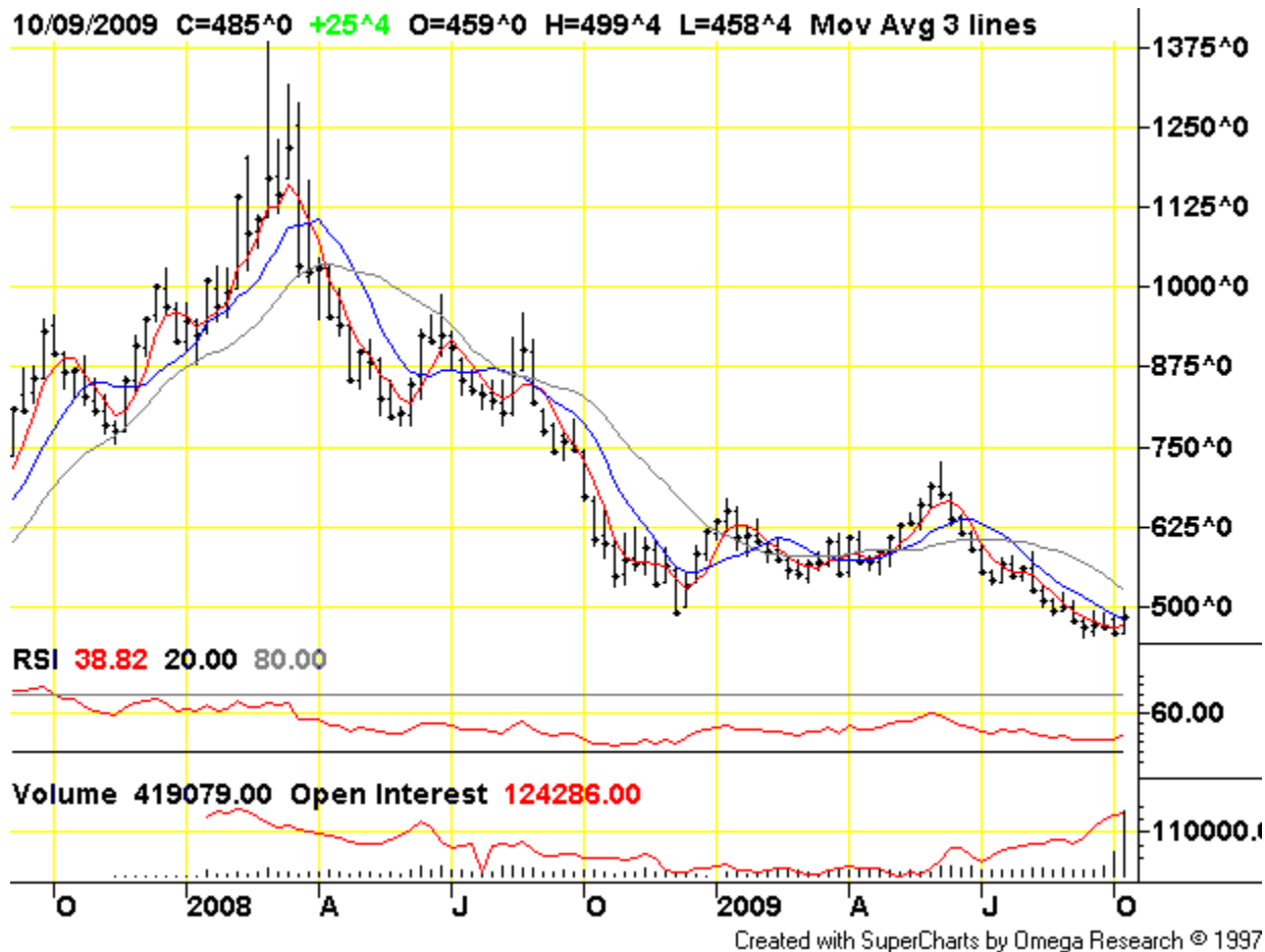
Chart courtesy of TradingCharts.com: http://futures.tradingcharts.com/