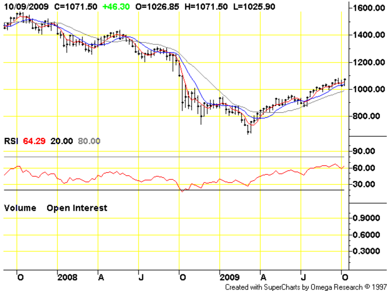
Chart courtesy of TradingCharts.com: http://futures.tradingcharts.com/