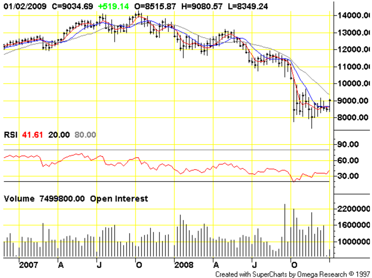
Chart courtesy of TradingCharts.com: http://futures.tradingcharts.com/