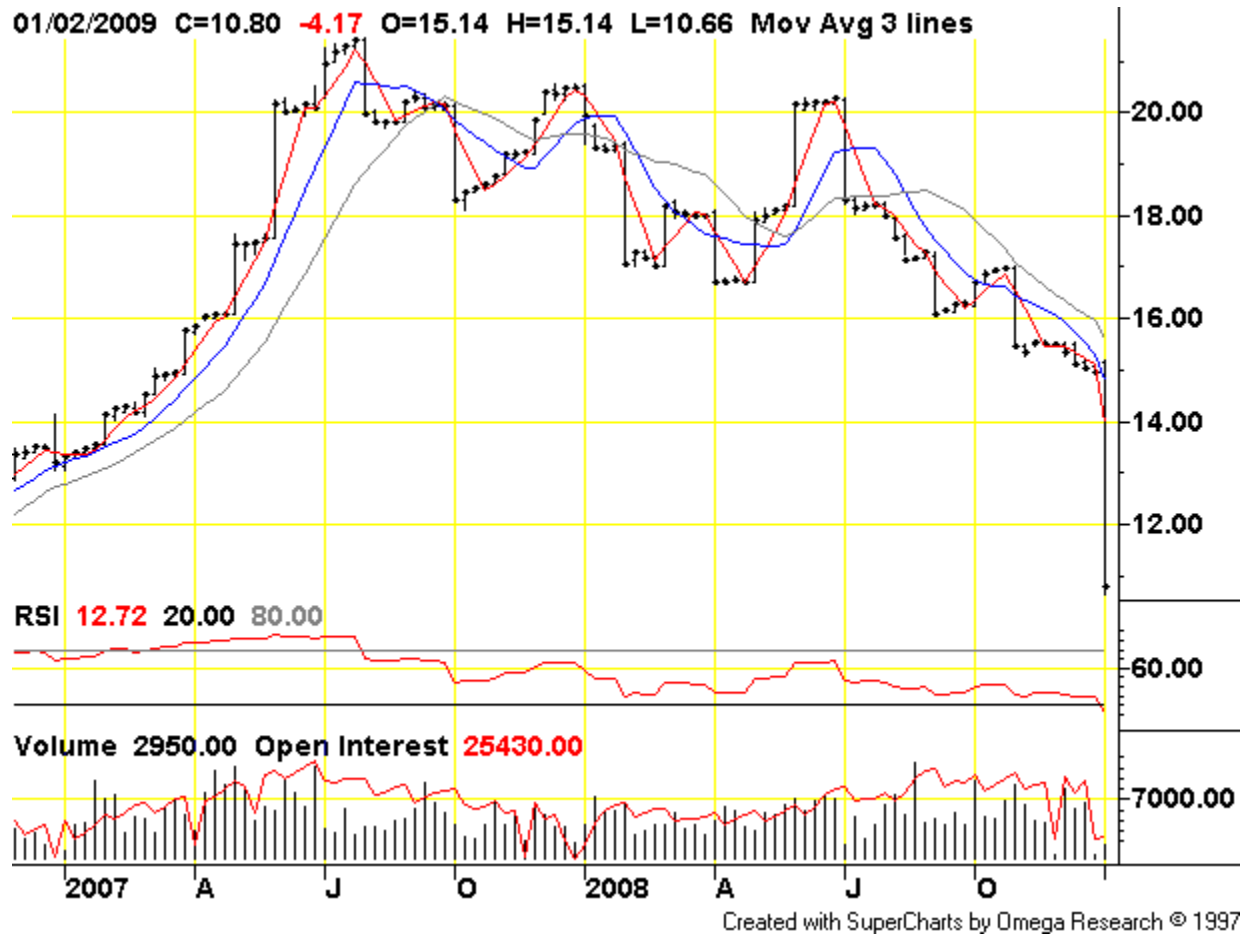
Chart courtesy of TradingCharts.com: http://futures.tradingcharts.com/