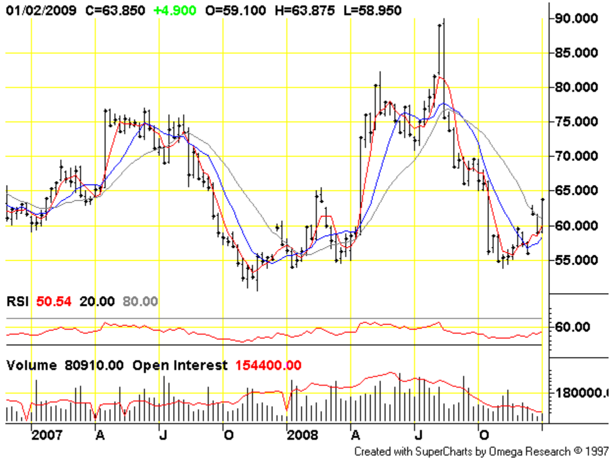
Chart courtesy of TradingCharts.com: http://futures.tradingcharts.com/