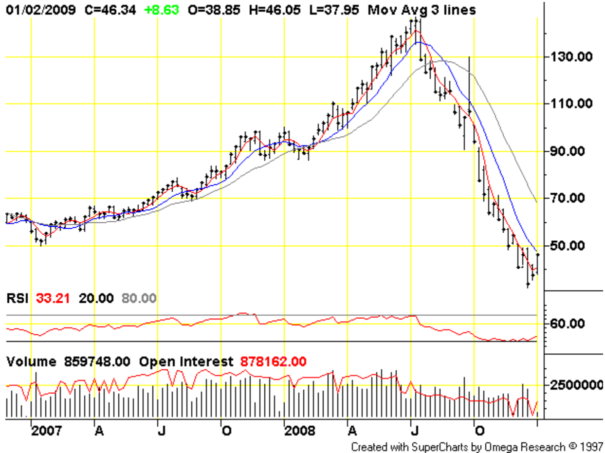
Chart courtesy of TradingCharts.com: http://futures.tradingcharts.com/