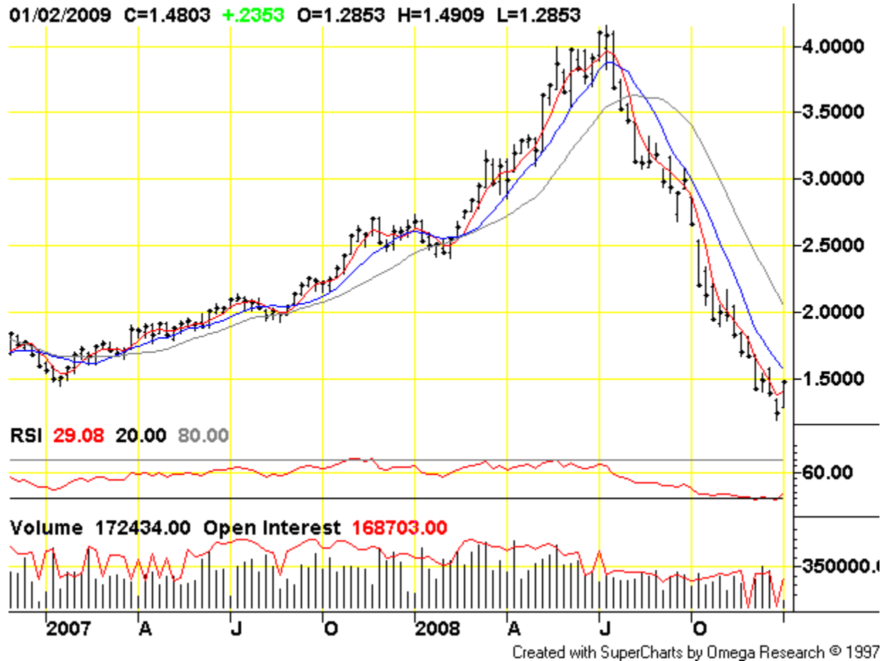
Chart courtesy of TradingCharts.com: http://futures.tradingcharts.com/