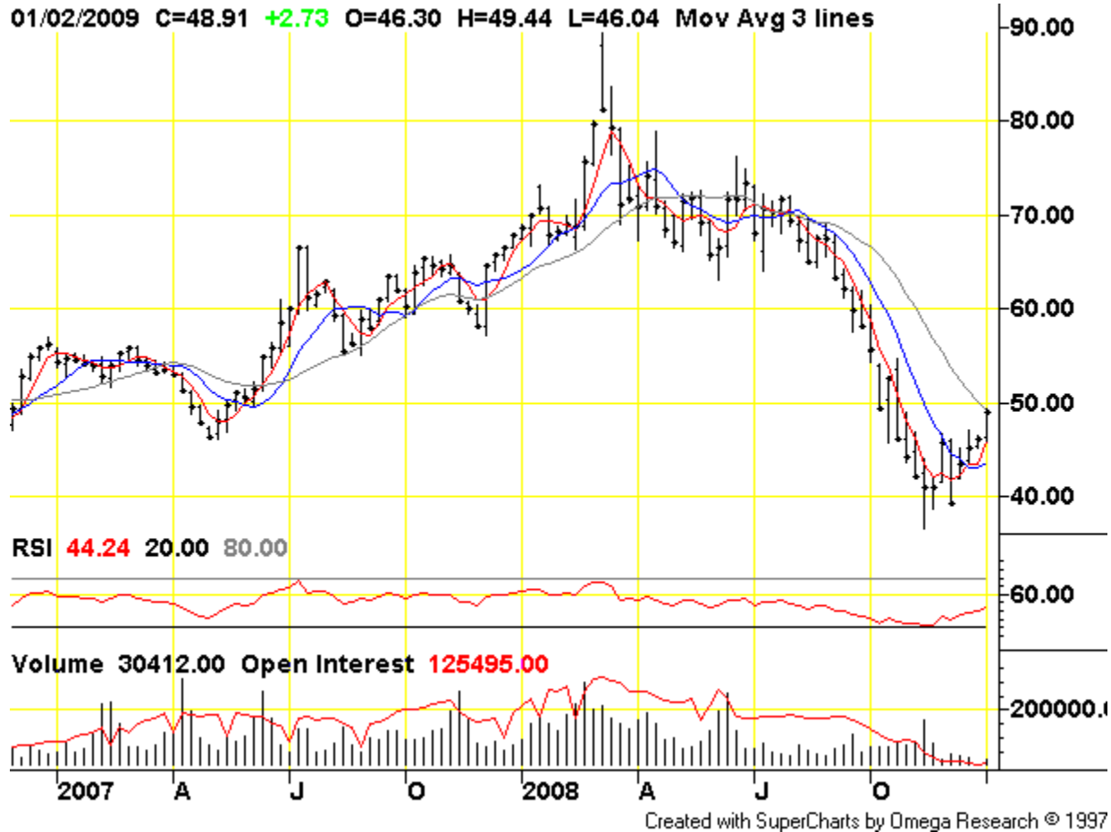
Chart courtesy of TradingCharts.com: http://futures.tradingcharts.com/