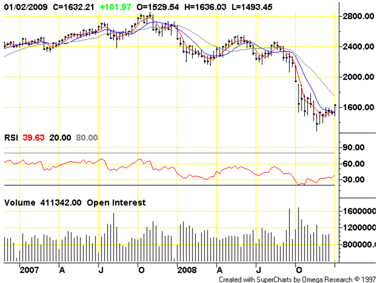
Chart courtesy of TradingCharts.com: http://futures.tradingcharts.com/