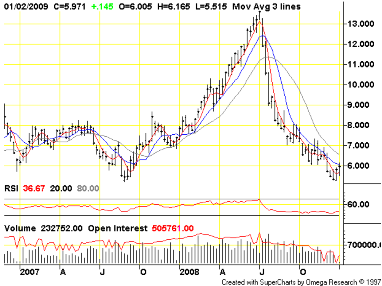
Chart courtesy of TradingCharts.com: http://futures.tradingcharts.com/