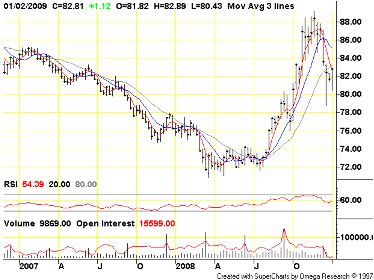
Chart courtesy of TradingCharts.com: http://futures.tradingcharts.com/