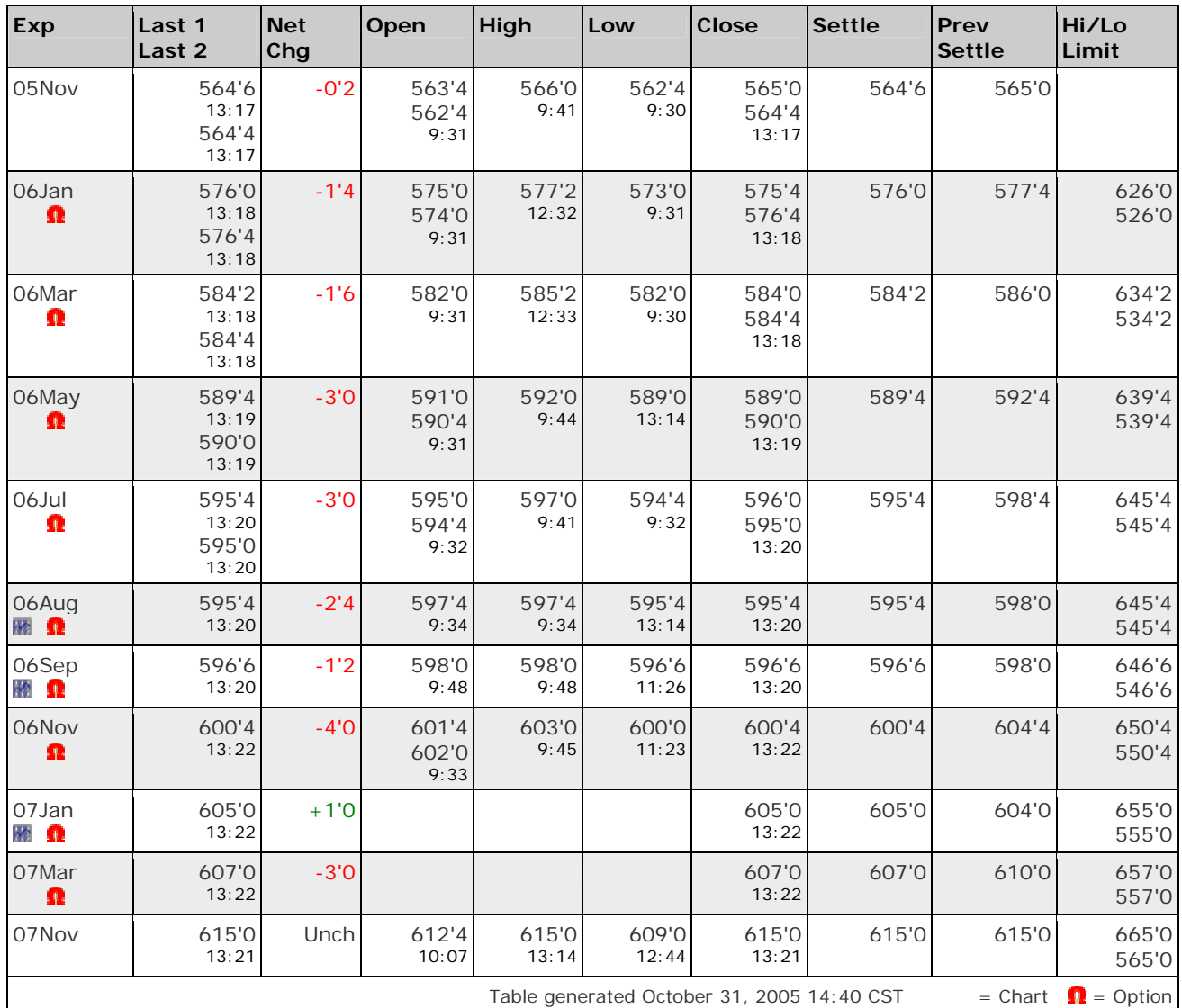
Table generated October 31, 2005 14:40 CST