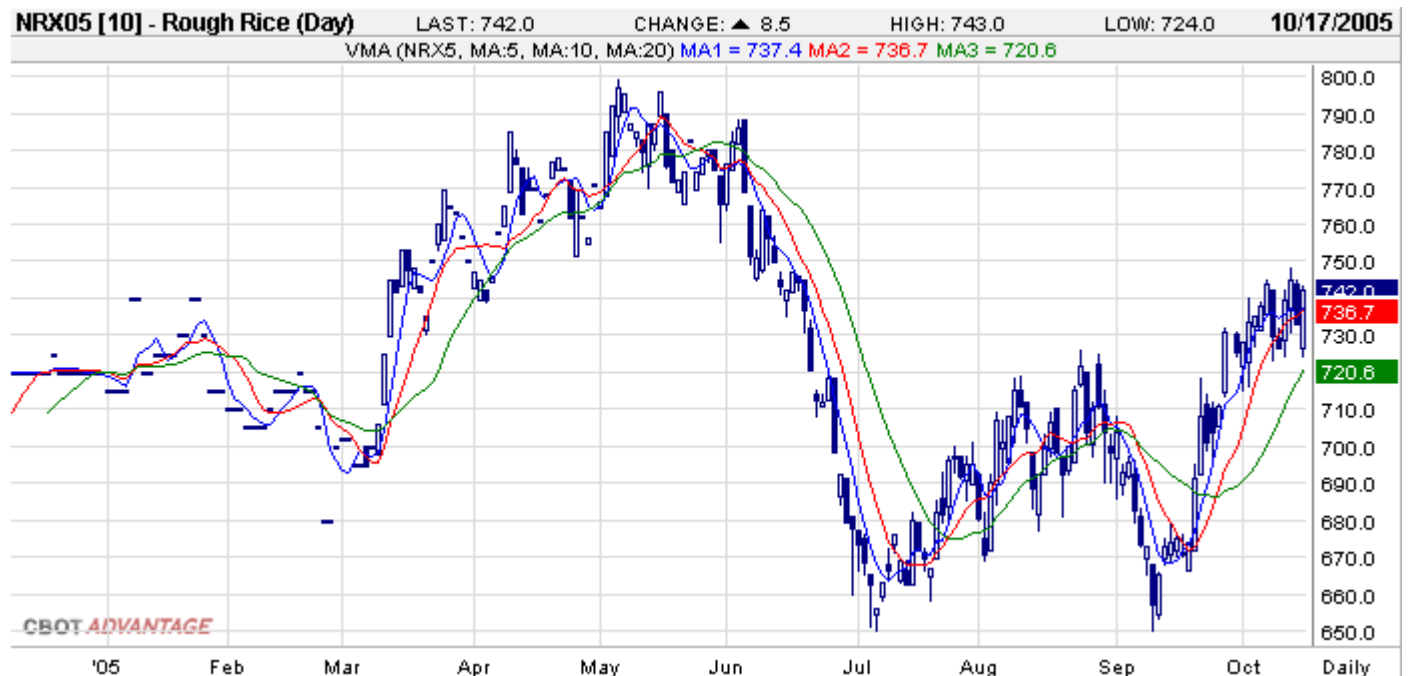
Rice Chart 1. CBOT Rough Rice Futures Chart, November 2005, Variable Moving Average (5, 10, 20)