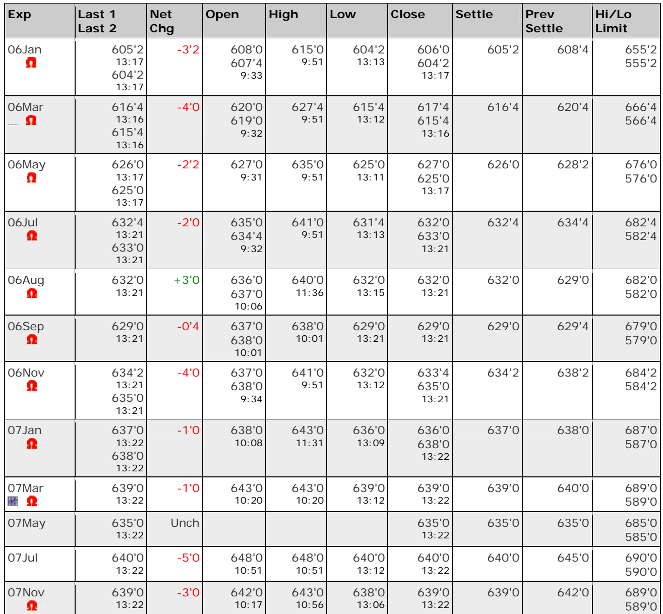
Table generated December 20, 2005 15:00 CST