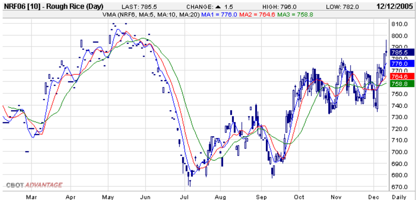
Rice Chart 1. CBOT Rough Rice Futures Chart, January 2005, Variable Moving Average (5, 10, 20)

Table generated December 12, 2005 15:00 CST = Chart ☒ = Option