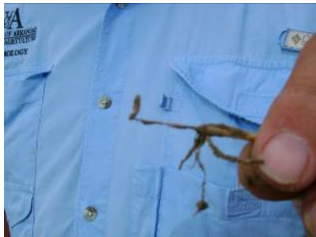
Girdling of the root by GC.