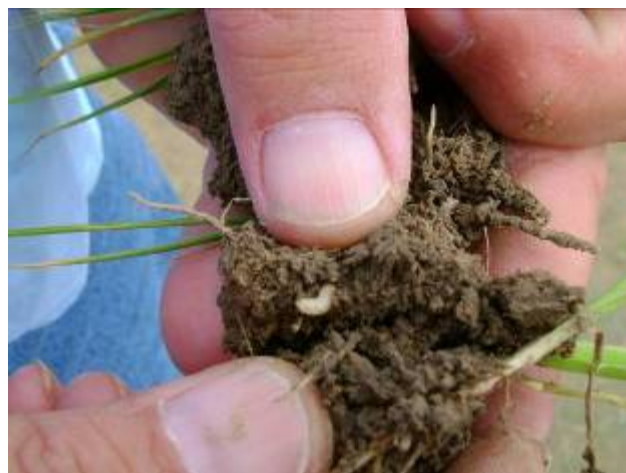
GC feeding on the root.

As many of you know, we received a Section 18 this year for Dermacor as a seed treatment on rice for control of rice water weevil, and we have had the opportunity to observe GC control with the product on several fields. We have observed an obvious vigor associated with the seed treatment and in some cases observed emergence of the treated rice four days prior to emergence of untreated seed in side-by-side observations. However, our sampling of large block trials has not yielded outstanding results