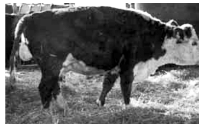
Figure 1. Cow exhibiting a water bag.

one to two hours after the water bag appears. It is important to observe a cow in labor and to leave her alone if the calving is proceeding normally. However, if the cow is in Stage 2 and no progress is observed after one hour, then assistance may be required.