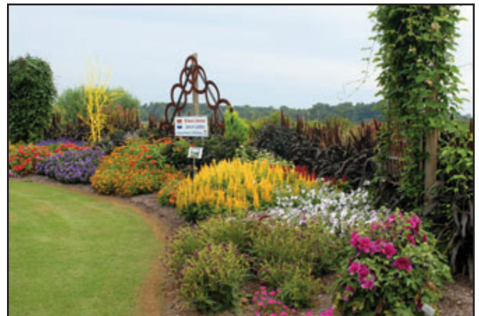
University of Tennessee Research and Education Center, Jackson, Tennessee