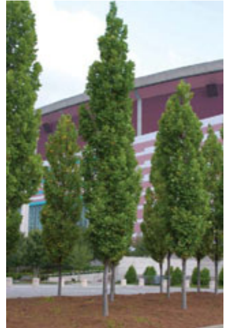
Liriodendron tulipifera 'Fastigiatum'

The 10th Annual Southern Plant Conference, hosted by the Southern