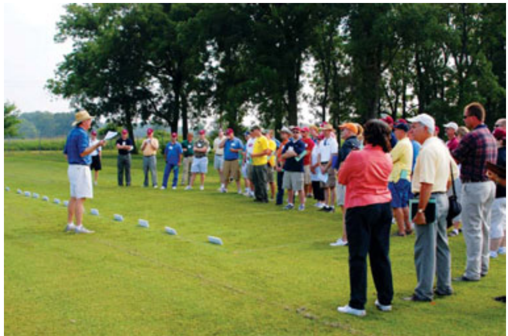
University of Arkansas Turfgrass Field Day

You don't have to look far to find great educational programs. Here are some highlights from programs I was able to attend recently.